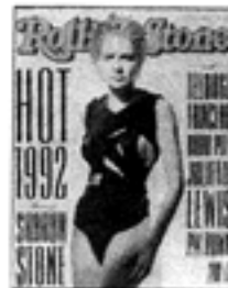
The 'Cold' Issue

Rolling Stone's annual "Hot" issue has anointed the Scottish guitar act Teenage Fanclub this year's "hot band" of the planet. While benighted mall kids rush for the group's new album, "Bandwagonesque," savvy touts can kiss an-